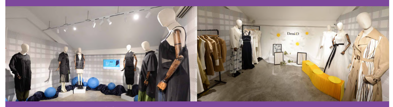
品牌 PUI 展場佈置 Venue Setting of PUI