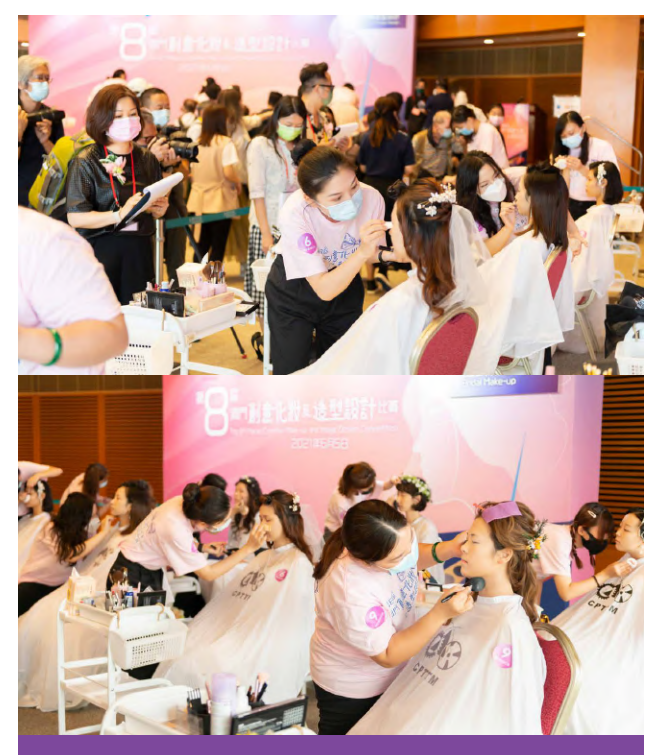
比賽情況 Competitors at work during competition

"The 8<sup>th</sup> Macao Creative Makeup and Image Design Competition" was successfully held by CPTTM at Macao Science Museum on 5<sup>th</sup> June 2021. The competition received much welcome and support from many local makeup aficionados. Enrollment was full for each of the three categories of competition (Creative Image Design, Chinese Bridal Makeup, Western Bridal Makeup). On the day of competition, with their creative minds and skillful hands, participants had one hour to create an exquisite makeup on the face of their models. A professional judging panel gave out the scores after judging and a prize award ceremony was held afterwards.