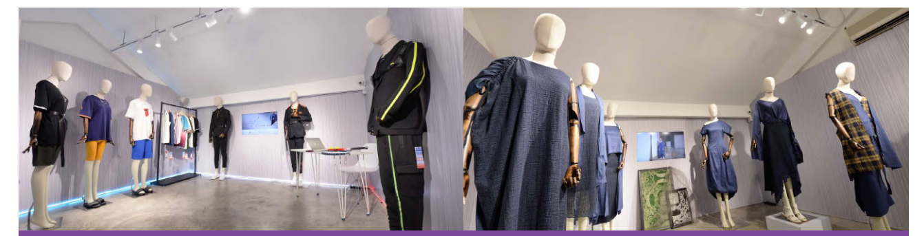
品牌 ANIFA 展場佈置 Venue Setting of ANIFA

Phase III exhibitor ANIFA integrates technology into style, using future generation fashion as design concept to create functional athletic suit. Phase IV exhibitor is Loom by Common Comma, a secondary line of Common Comma. Using the great nature as creative inspiration, the brand intricately combines and connects traditional craftsmanship with modern innovative thinking. Phase V exhibitor PUI uses concepts from environmental protection, traditional craftsmanship, and cultural heritage to create their fashion. Finally, Phase VI exhibitor Demi*D showcases a series of ladieswear created for capable females with good taste, letting the public feel the intellectual beauty of new era women through these exhibits.