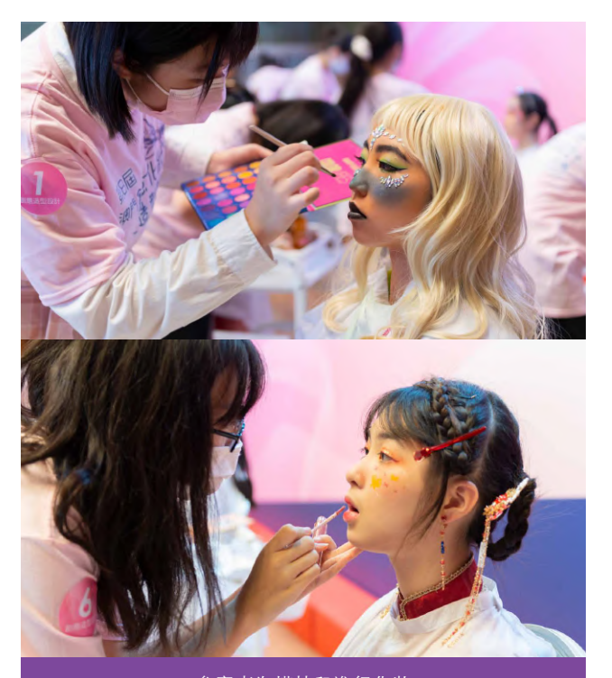
參賽者為模特兒進行化妝 Competitors putting makeup on models