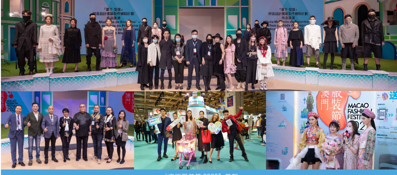
"澳門服裝節 2020"花絮 Highlights from "Macao Fashion Festival 2020"