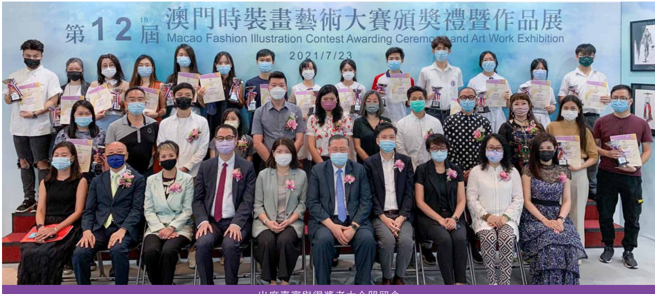
出席嘉賓與得獎者大合照留念 Group photo of honarable guests and winners

The theme of this year's contest was "Bequeathing Heritage and Love". Participants were to use Macao Intangible Cultural Heritage as their creative concept, bequeathing culture and love of Macao through their creative illustrations. A total of 203 entries were received this year, with 134 from Student Category and 69 from Open Category.