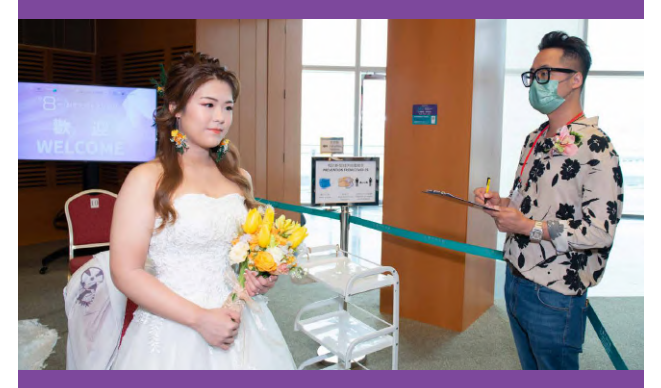
評判為化妝後的模特兒評分 Judge giving score to model with completed makeup